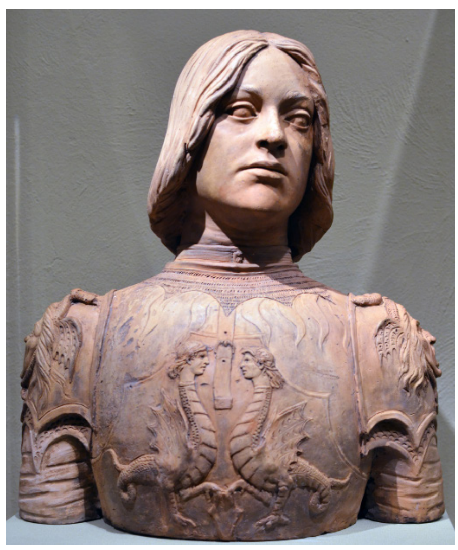
Fig. 2: Italian, Florence, Bust of Lorenzo de' Medici , probably 19th century (in the manner of Andrea del Verrocchio), terracotta, 57.2 \times 48.3 \times 24.1 cm (22 1/2 \times 19 \times 9 1/2 in.), Boston, Museum of Fine Arts.